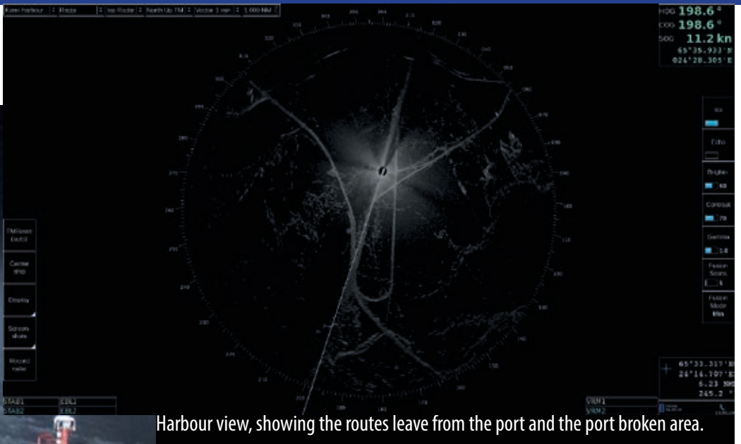
Harbour view, showing the routes leave from the port and the port broken area.