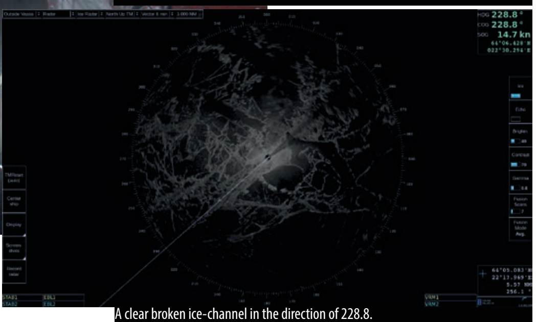
A clear broken ice-channel in the direction of 228.8.